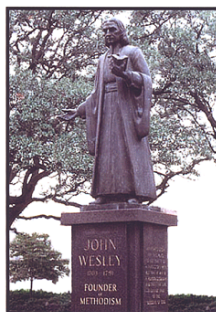
John Wesley monument