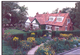
C. S. Lewis' home, The Kilns, in Oxford